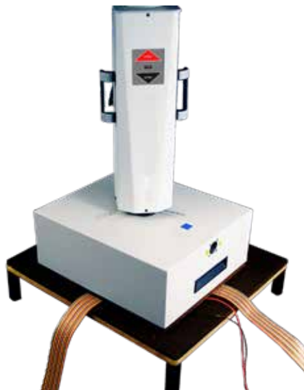
Shown with optional BASE. The Hood style THERMOCHAMBER™ is lowered over the test subject, enclosing it and creating a moisture free thermal test environment.