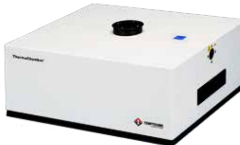
The Hood's top connector port enables easy connection to the THERMOSTREAM® air source.