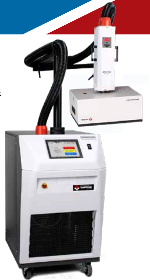
MOBILETEMP™ system configured with Hood style THERMOCHAMBER™ and a THERMOSTREAM® temperature source

THERMOCHAMBERS™ are available in a variety of styles and sizes and they can be used interchangeably with THERMOSTREAM® temperature sources to provide a modular and flexible range of MOBILETEMP™ systems.